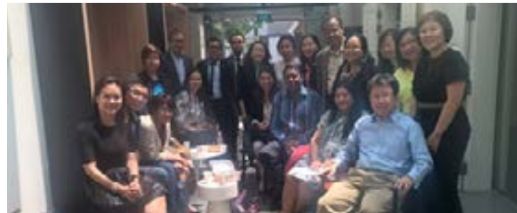
A gathering of fellow psychologist at ARUPS Congress 2015