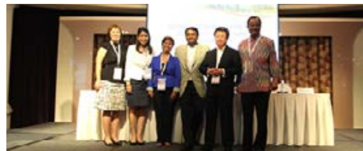
Signing of Surabaya Singapore Declaration at ARUPS Congress 2015