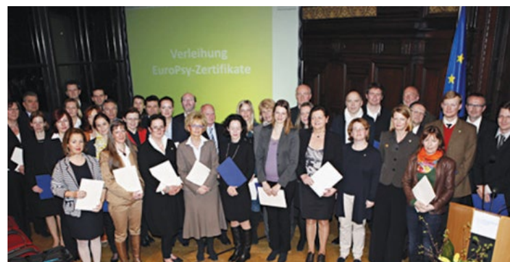
EuroPsy2012 Awards Ceremony