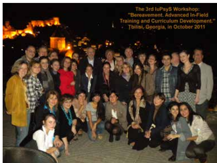
The third IUPsyS workshop in the Series on Conflict Prevention in the South Caucasus Region in Tbilisi, Georgia, 2011