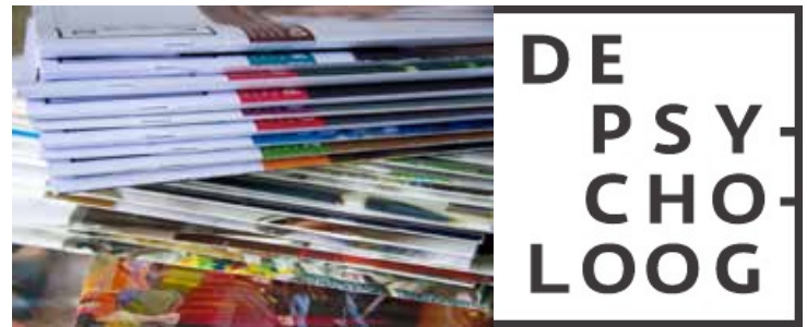
The NIP publishes a newsletter, "De Psycholoog" (The Psychologist)

http://www.psyinip.nl/the-dutch-association-of-psychologists.html