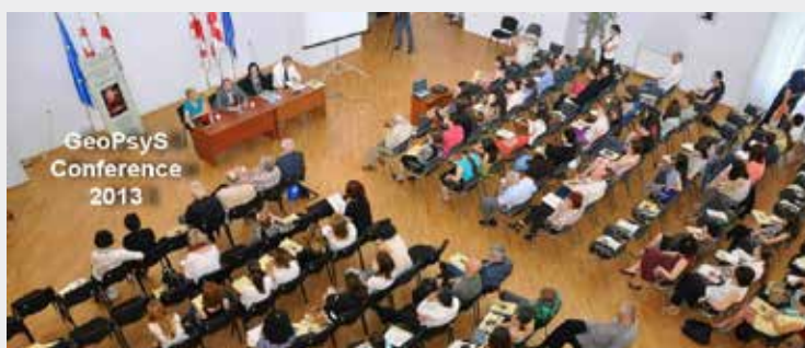
GeoPsyS Conference 2013

At present GeoPsyS aims to further develop academic (theoretical, experimental) and applied psychology in Georgia; establish contacts with scientific and educational institutions, the Academy of Sciences, structures of the Ministry of Education and Sciences, civil society organizations and individual scientists. GeoPsyS intends to enhance collaboration with the related disciplines; organize scientific conferences, discussions, seminars, workshops, training on the issues of psychology; carry out educational, awareness raising and publishing activities. GeoPsyS plans to hold elections in March 2015.