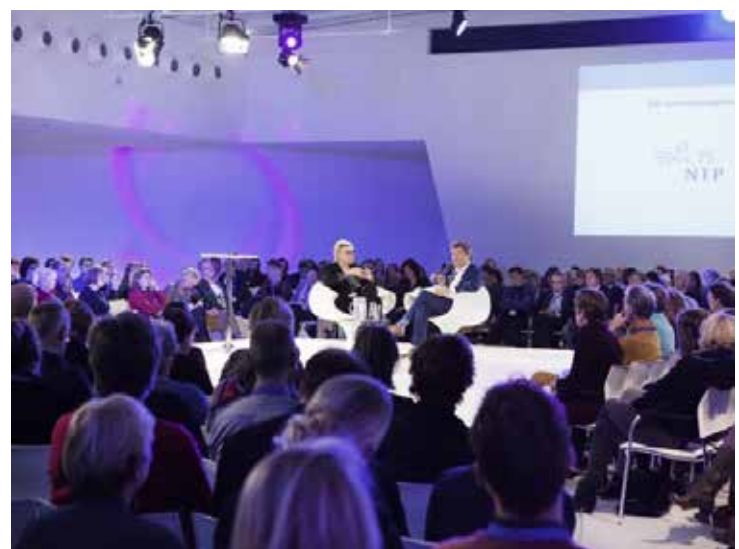
Meeting with Members of the NIP during the 75th Anniversary Conference in 2013