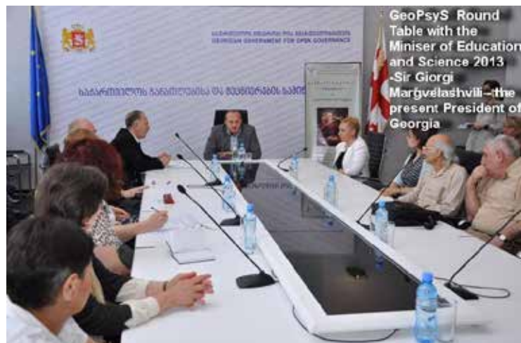
GeoPsyS Round Table Discussion