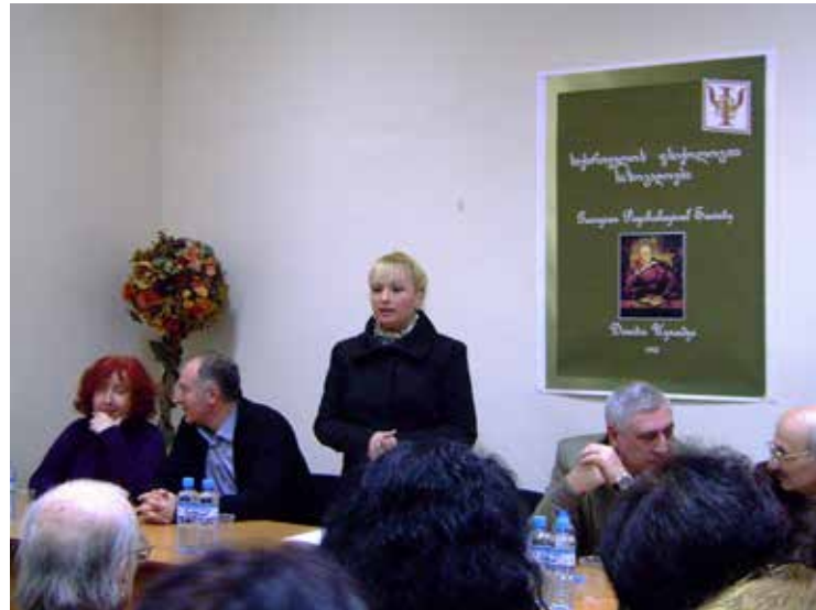
Meeting at the GeoPsyS 2013