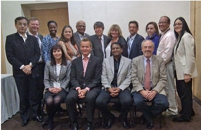
The 2012-2016 Executive Committee in Cape Town, July 2012

The Union's General Assembly meeting, held in Cape Town July 2012, appointed a new Executive Committee for the period 2012-2016.