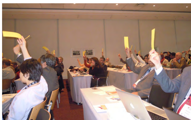
The 2012 General Assembly voting on the admission of new National Members, including Brazil