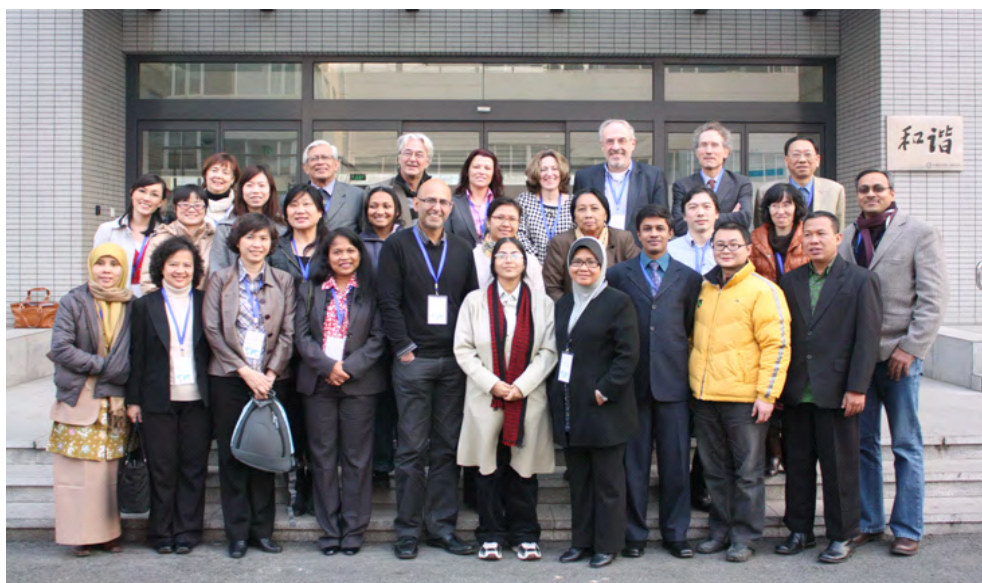
Participants and Faculty, Beijing