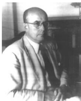
Emilio Mira y Lopez

Also at the XIII Congress of Psychology, the Statutes of IUPsyS, which currently brings together more than 80 national associations