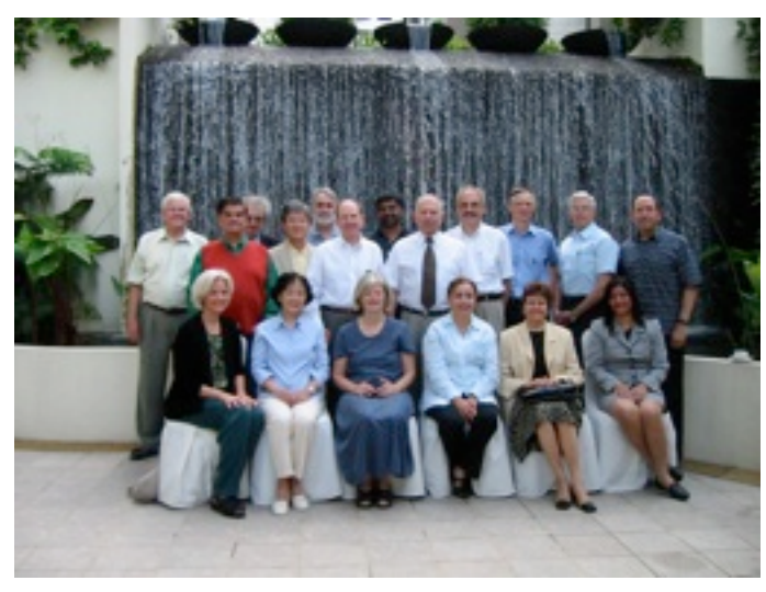
IUPsyS Executive Committee, Istanbul, 2007

Over the next 12 years I came to know the Union from the top down – as the largest and most broad psychology organization, serving the development of a discipline and its organizations and their members,