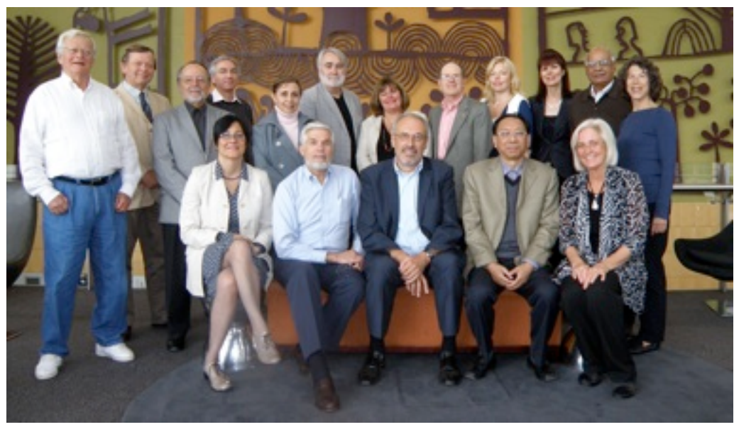
IUPsyS Executive Committee, 2009, Cape Town, South Africa

Over the last 12 years this has begun to change – the representation of women and colleagues from all corners of the world has increased in the Executive Committee and Assembly (there still has not been a female president, though); the issues the Union addresses involve people and perspectives from a broader set of countries; the Union has explicitly taken capacity building and increased engagement of the majority world as a strategic goal. Such a focus is also positioning the Union to fulfill its mandate as carrier of standards for the discipline – for example in its current attention to education and training in psychology. In addition there is increased involvement of psychologists with little prior history with the Union, always a healthy addition to an organization.