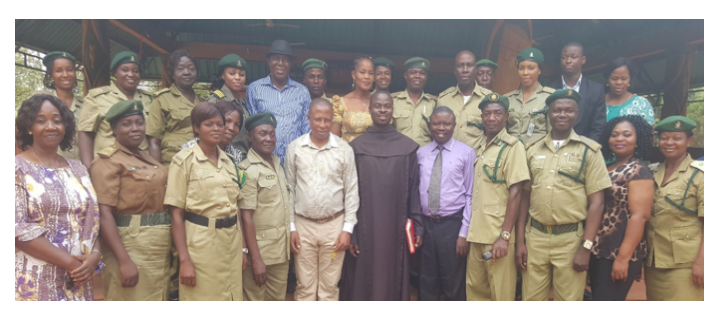
Group photograph of the participants of the maiden edition of the NPA-CAPIO collaborative workshop