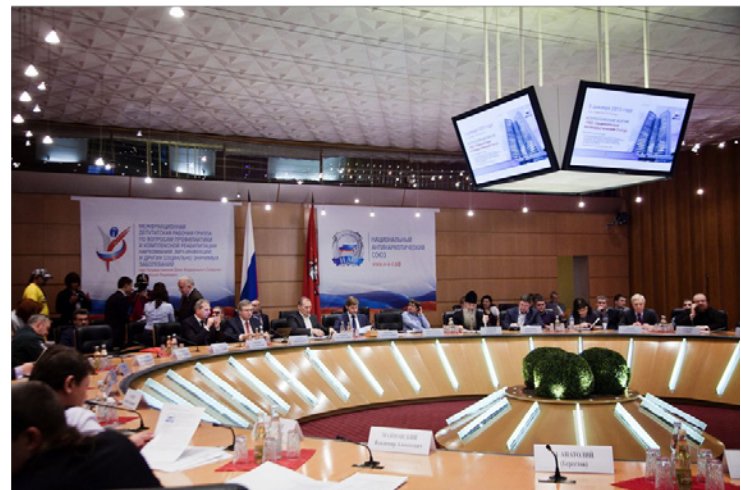
RPS participating in drug usage prevention working groups of State Duma of Russia.