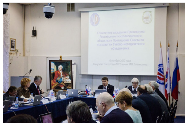
Dialogue between RPS and Universities during joint meetings with the Presidium of RPS and the Russian Educational-Methodological Council.