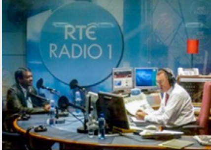
Saths Cooper is interviewed on RTE Radio 1 Today with Sean O'Rourke.