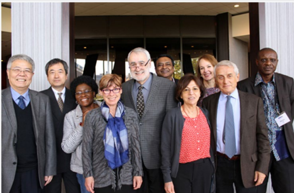
ISSC Executive Committee.

For more information, see: http://www.worldsocialscience.org/2014/05/118th-meeting-issc-executive-committee/