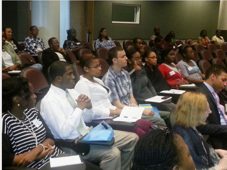
Psychology students and psychologists in the audience at CRCP.