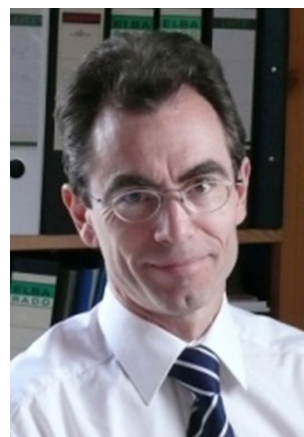
President: Association of German Professional Psychologists

The DGPs has 15 sections representing the different psychological disciplines. The Executive Committee is responsible for the management of the Society. The Executive Committee may appoint additional committees to address special scientific as well as organizational issues.