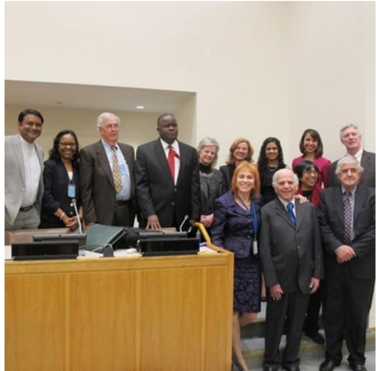
7th Annual Psychology Day at the United Nations.

The live webcast of the 7th Annual Psychology Day may be viewed on UN Web TV at: http://webtv.un.org/search/psychological-contributions-to-sustainable-development-global-challenges-and-solutions/3507560401001?term=Psychology