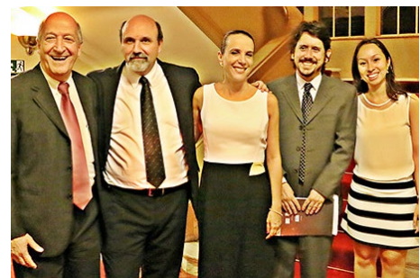
The Board of Directors of the Brazilian Society of Psychology.