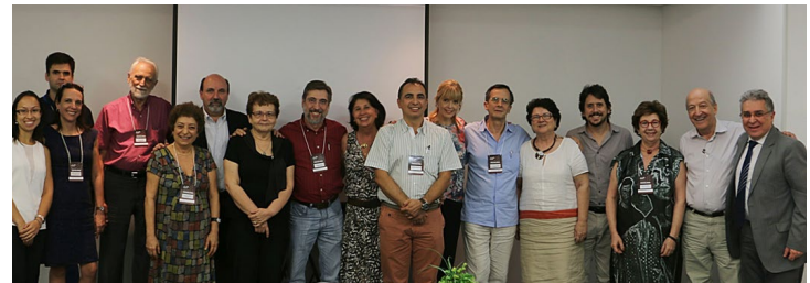
The Board of Directors and Council of the Brazilian Society of Psychology.