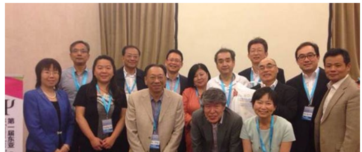
Participants in the Chinese-Korean-Japanese psychological associations symposium in Beijing, China.