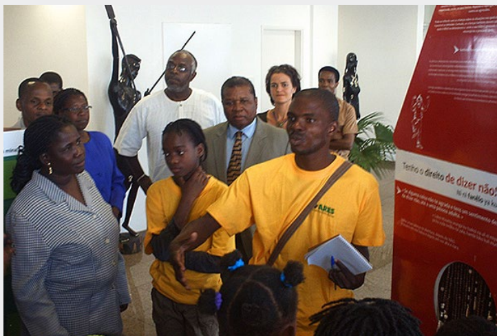
Participants of the "My Body Belongs to Me" - prevention of child sexual abuse project.