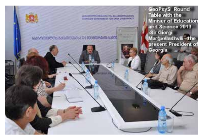
GeoPsyS Round Table Discussion