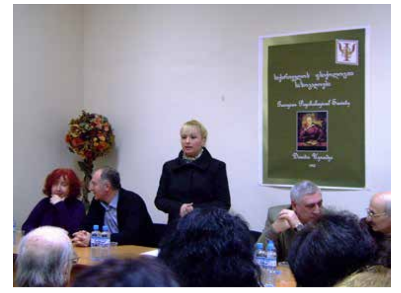
Meeting at the GeoPsyS 2013