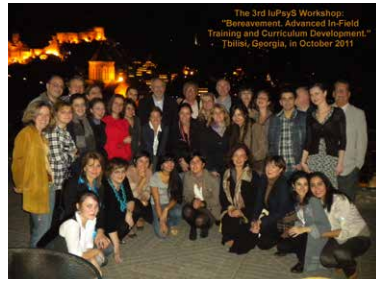
The third IUPsyS workshop in the Series on Conflict Prevention in the South Caucasus Region in Tbilisi, Georgia, 2011