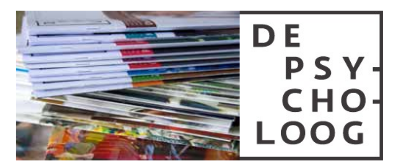
The NIP publishes a newsletter, "De Psycholoog" (The Psychologist)

http://www.psynip.nl/the-dutch-association-of-psychologists.html