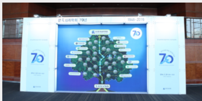
The KPA history wall - each circle represents a division of the KPA