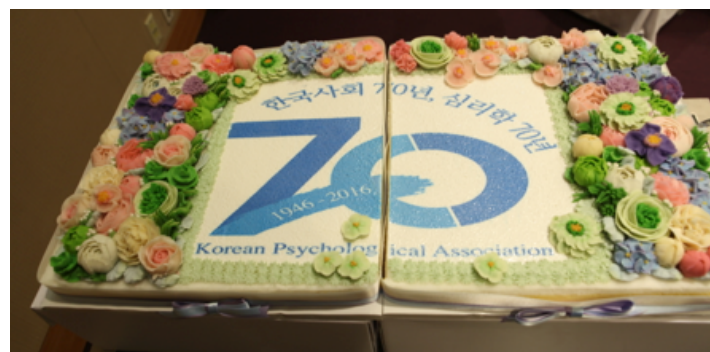
Rice cake to celebrate KPA 70th anniversary