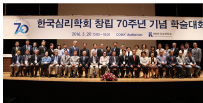
The KPA President, the Preparatory Committee, and Senior Members who helped to build KPA