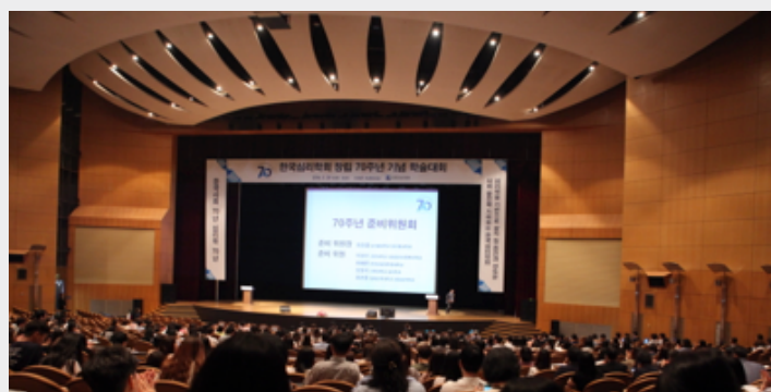
The main event of the 70th anniversary - presentations on "Psychology in Korea: Past, Present, and Future."

To celebrate its 70th anniversary, the KPA held a conference in Seoul at the COEX (Convention & Exhibition) on the 20th of May 2016. Morning sessions were composed of workshops and symposia hosted by all of the fifteen divisions of the KPA. Afternoon sessions were organised around the theme, "Psychology in Korea: Past, Present, and Future." There were also exhibitions that highlighted the history of Korean psychology for the past 70 years. Over a thousand members registered for the event, and around 750 members participated in the anniversary ceremony.