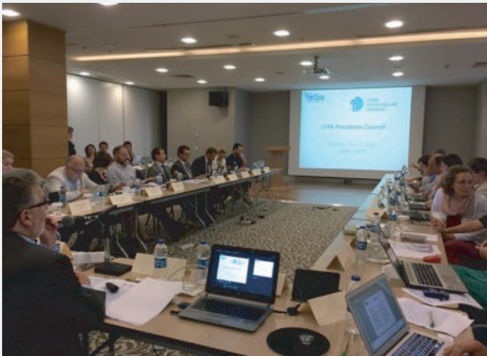
EFPA Presidents Council Meeting hosted by TPA in İstanbul

This year, the Turkish Psychological Association is celebrating its 40th anniversary and the 19th National Congress of Psychology will be held from 5-7 September 2016. Izmir will give the opportunity to members of TPA and other psychologists to discuss how to contribute to the development of such a unique profession.