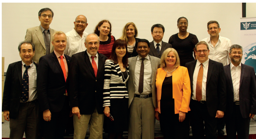
2016-2020 IUPsyS Executive Committee

A comprehensive review of the Union's engagement with the United Nations and related organizations was presented. The Presidential Task Force on the United Nations proposed "six major recommendations of a multicomponent strategy for the Union's engagement with the United Nations and its related agencies. Initial action steps associated with each recommendation have been also been developed. The recommendations are as follows: 1. Collaborate with the UN, its agencies and missions on activities centered around the SDGs (while maintaining current engagements); 2. Establish a standing committee on the UN and related agencies whose goal is to develop and implement a strategic plan for collaborating with the UN; 3. Develop a model for cultivating long-term relationships with the UN agencies and Permanent Missions; 4. Appoint 2-3 representatives to the UN Headquarters in NYC to provide continuity of presence and involvement with the UN and the Permanent Missions; 5. Continue cooperative partnerships with other psychological associations at the UN and develop ties to non-psychology NGO's working at the UN; and 6. Communicate with and involve national members and regional affiliates in IUPsyS' work with the UN, its agencies and Missions."