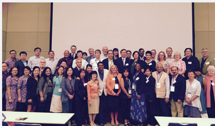
Participants of the Asia-Pacific Psychology Leadership Forum

Participants expressed the need to create a platform for communication between countries, as well as the importance of developing research capacity while preserving the local identity of the discipline. To signify their commitment towards the development of an Asia-Pacific psychology alliance, representatives signed the Yokohama Declaration ( http://www.iupsys.net/about/declarations/index.html ) on 27 July 2106, which marks a significant milestone in the history of psychology in this region.