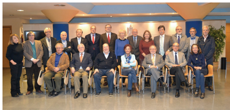
Inauguration of the Spanish Academy of Psychology on 26 November 2015

Further information may be found at http://www.academiadepsicologia.es/