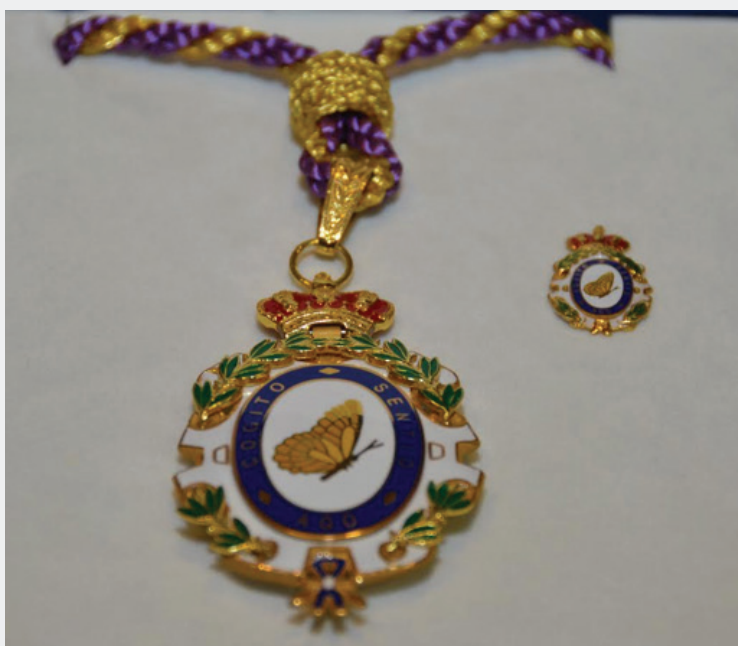
Ceremonial medallion and pin of the Spanish Academy of Psychology - Cogito, Sentio, Ago. The resting butterfly is the arcane symbol of psychology.