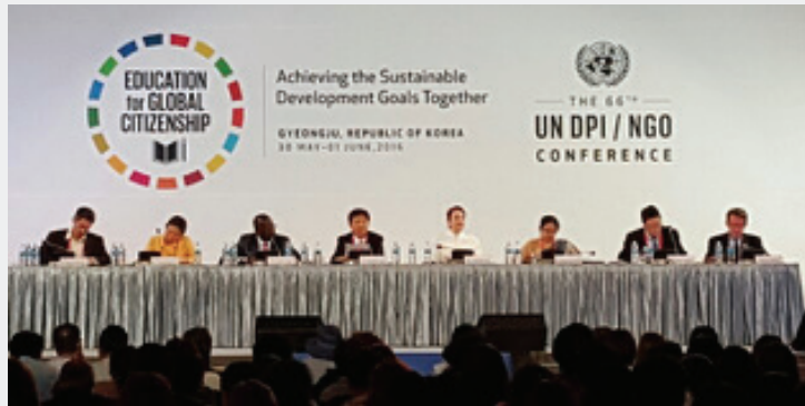
Participants from the Roundtable discussions

During these roundtable sessions presenters discussed and gave their opinions on the designated issues. Audiences responded passionately to these issues. The IUPsyS delegation strongly advocated for the including psychology when educational policies for global citizenship are designed and executed.