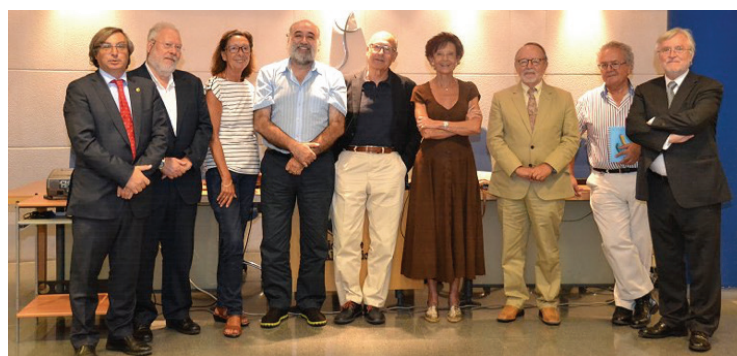
First Executive Committee of the Spanish Academy of Psychology, 31 August 2015