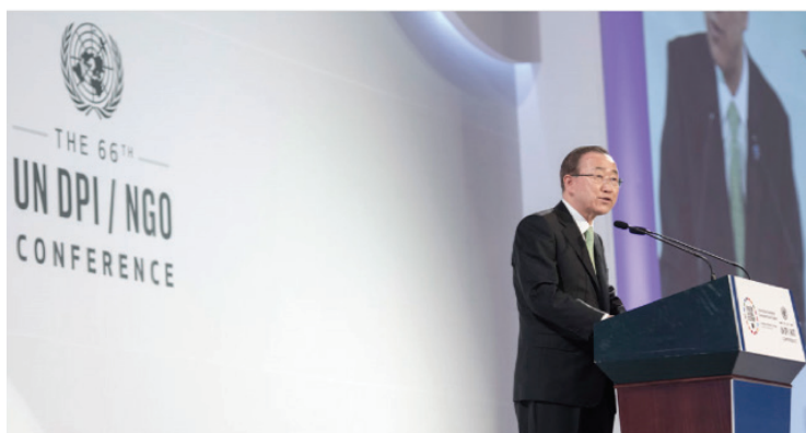
Secretary-General Ban Ki-moon addresses the opening session of the UN Department of Public Information (DPI)/Non-Governmental Organization (NGO) Conference in Gyeongju, Republic of Korea.