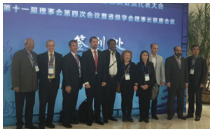
Presenters and the Chairperson of the International Academic Symposium of CPS2016 annual conference.

The ancient city of Xi'an is regarded as a starting point of the land Silk Road, and CPS believes that psychologists can play a role in such a multiple connection among psychologists of the neighboring countries of the Belt and this Road. Representatives from the Russian, Indian, Pakistani and Mongolian psychological associations participated in the symposium. IUPsyS and the APA also participated, witnessing the very first international symposium ever held during the CPS Annual Conference.