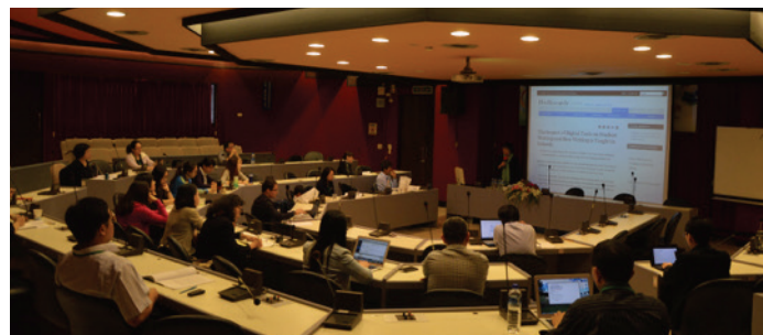
Forum at the 2015 Taiwanese Psychological Association Annual Convention and International Convention