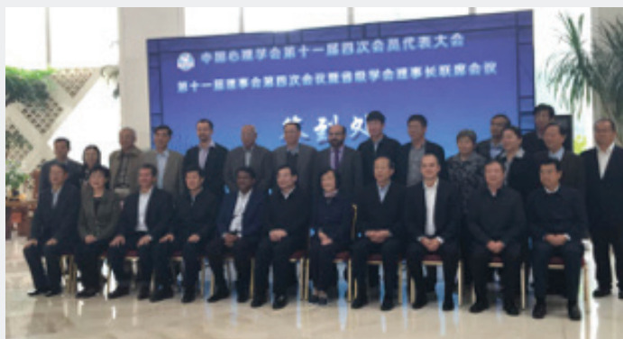
Group photo of Shaanxi Province Officials, CPS leaders and the participants of "The Belt and Road Initiative" International Symposium;

The possibility of future collaboration coincided with a key IUPsyS goal of psychology serving humanity not only in mental health and wellbeing but also creating better understanding of behavior at local, national, regional and global levels. By taking advantage of "The Belt and Road Initiative", Chinese psychologists are committed to work with their counterparts in neighboring countries, as well as in other parts of the world, to pursue the general goal of psychology serving humanity.