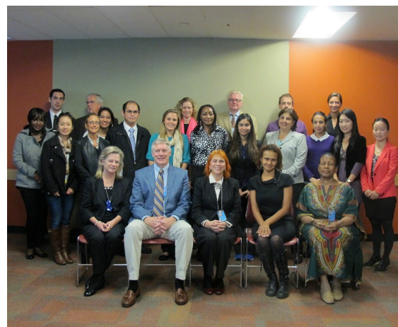
Members of the Psychology Coalition of NGOs

The Psychology Coalition of NGOs, of which IUPsyS is part of, accredited at the United Nations (PCUN) consists of psychologists who represent Non-Governmental Organizations (NGOs) accredited at the United Nations (UN) and psychologists affiliated with United Nations departments, agencies and missions. Members of the Coalition advocate for the application of psychological science, principles, and practice to the UN agenda, including the 2030 Sustainable Development Goals. The Coalition seeks to accomplish its aims through advocacy, research, education, and policy and program development, guided by psychological knowledge and perspectives to promote human dignity, human rights, psychosocial well-being, resilience and positive mental health.