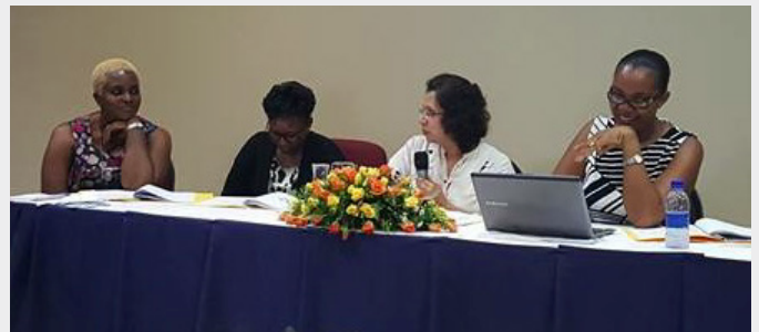
Outgoing PAZ Executive during the AGM.