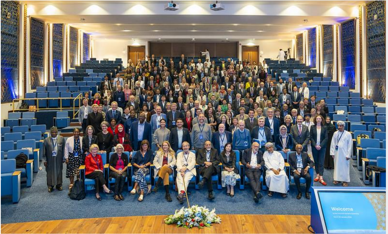
ISC General Assembly