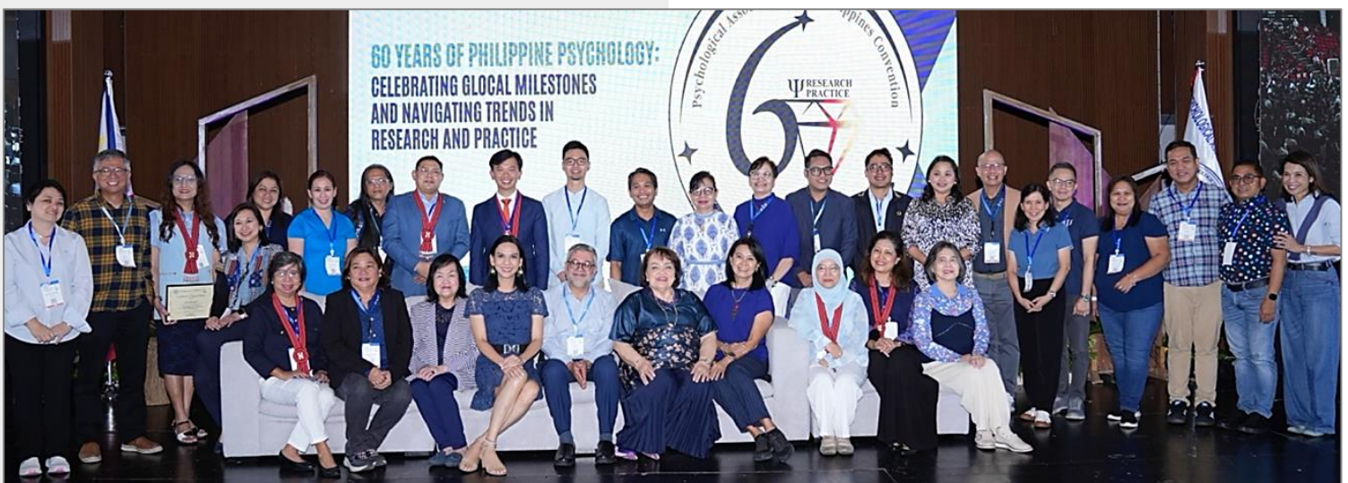
PAP Board, PAP Past Presidents, IUPsyS President, and ARUPS Officers