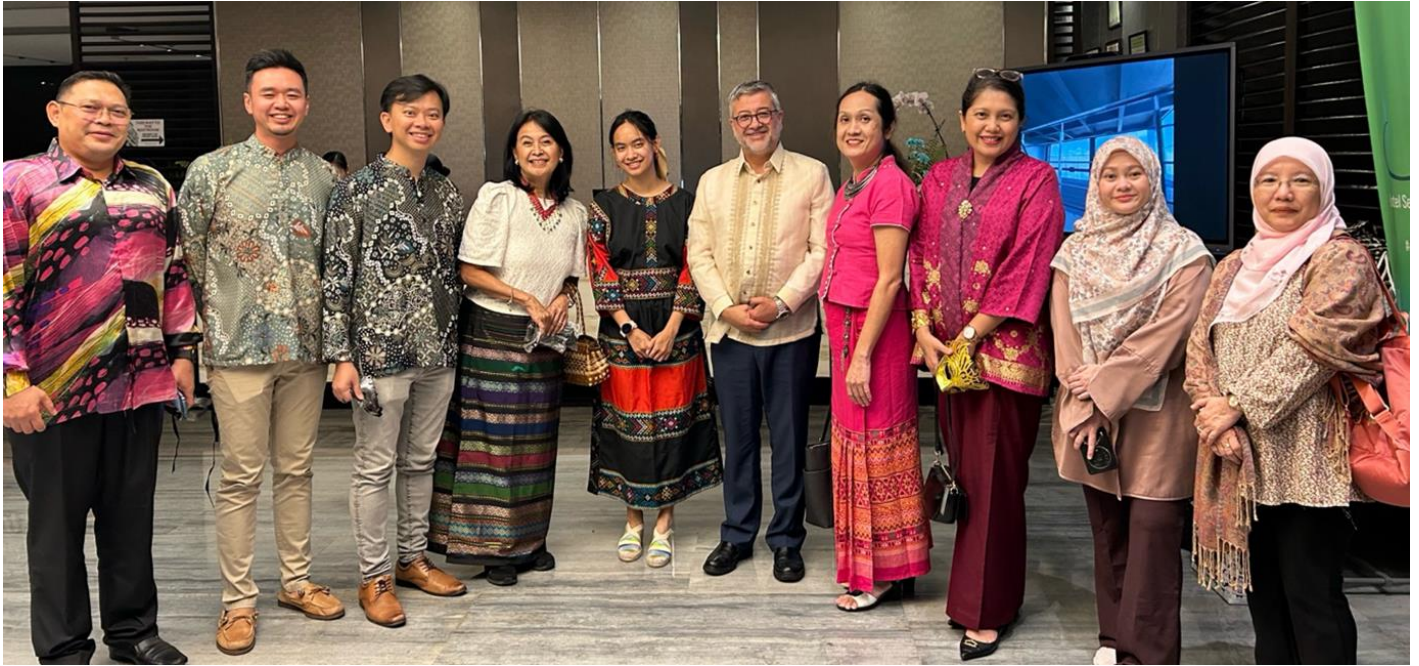
ARUPS Officers and IUPsyS President

Their sessions and panel discussions emphasised the shared goals and collective efforts of ASEAN nations in advancing the field of psychology, fostering a sense of unity and collective progress among neighbouring countries while showcasing the Philippines' active role in ASEAN psychology.